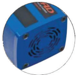
Integrated Fan Kit