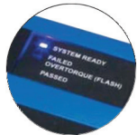
LED lights located on both sides