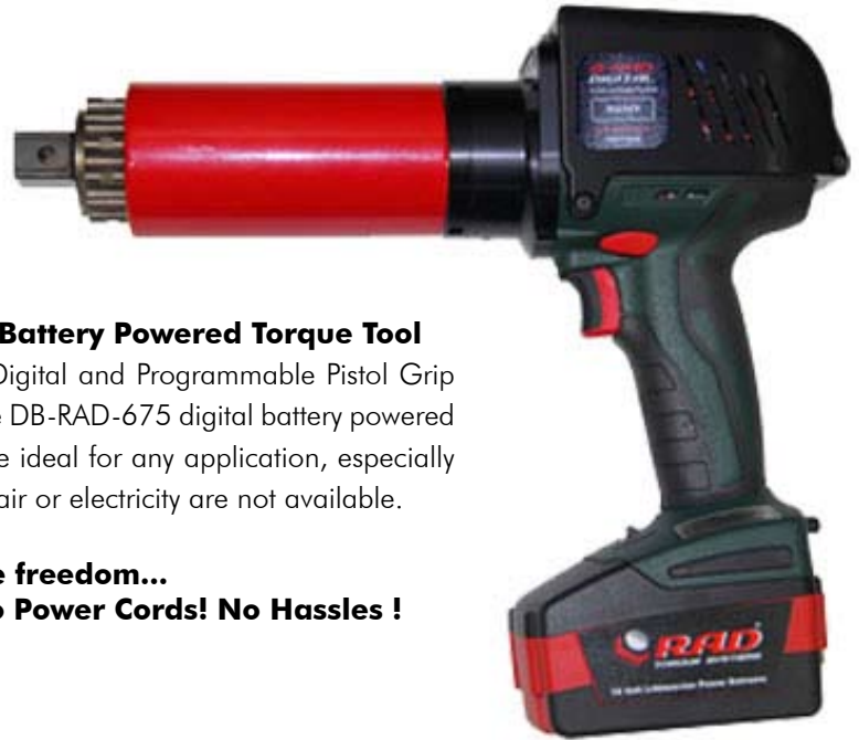
DB-RAD 675 Digital Battery Series Torque Tool

Just imagine the freedom... No Air Lines! No Power Cords! No Hassles !