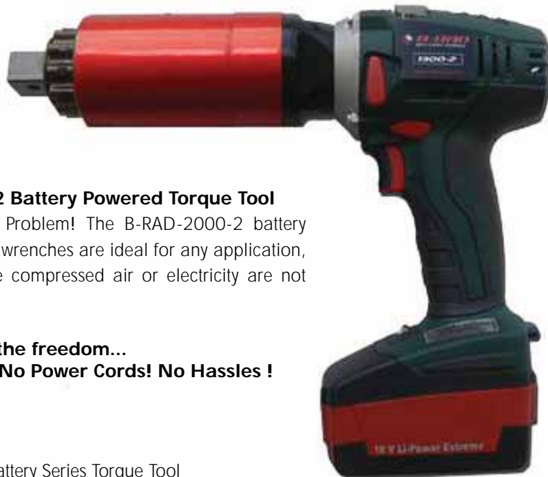
B-RAD 2000-2 Battery Series Torque Tool

Just imagine the freedom... No Air Lines! No Power Cords! No Hassles !