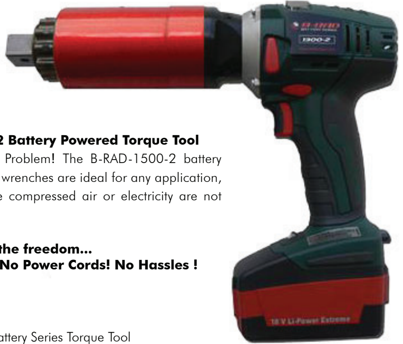
B-RAD 1500-2 Battery Series Torque Tool

Just imagine the freedom... No Air Lines! No Power Cords! No Hassles !