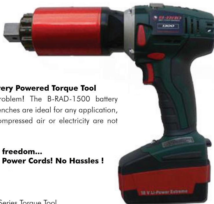
B-RAD 1500 Battery Series Torque Tool

No Air Lines! No Power Cords! No Hassles !