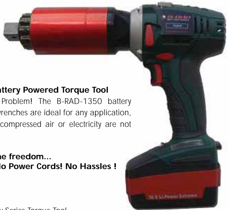
B-RAD 1350 Battery Series Torque Tool

No Air Lines! No Power Cords! No Hassles !