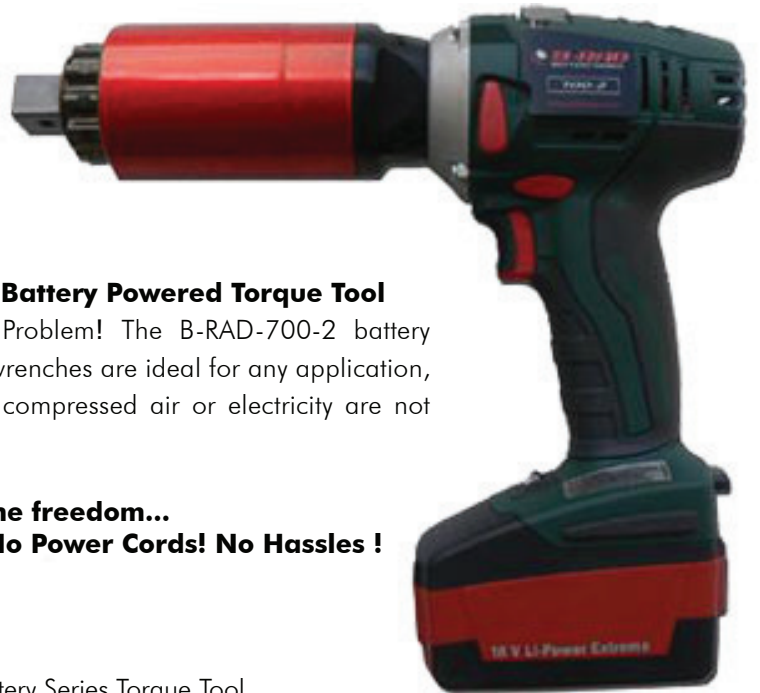
B-RAD 1000-2 Battery Series Torque Tool

Just imagine the freedom... No Air Lines! No Power Cords! No Hassles !