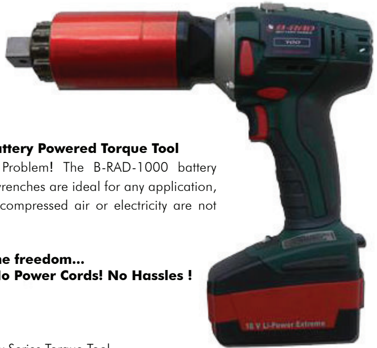
B-RAD 1000 Battery Series Torque Tool

Just imagine the freedom... No Air Lines! No Power Cords! No Hassles !